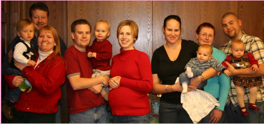
Support Group Holiday Party: December 16, 2007